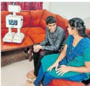
ಕನ ಕಲ್ಲಿ ಗ್ರಾಡಿಕಿ ವಿವರಿಸ್ತು.